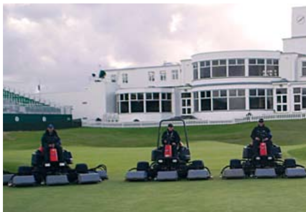
The Open Championship 2008, Royal Birkdale.

Over in Kentucky, Jacobsen – the official equipment supplier to the USPGA – delivered a package of more than 20 new machines in early summer to help the renovated Valhalla course get ready for the 37th Ryder Cup . The equipment included new Eclipse hybrid pedestrian mowers for greens and tees and