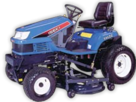
Iseki SXGarden 19