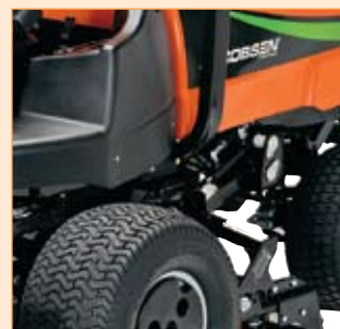
Fully welded frame provides greater rigidity and stability.