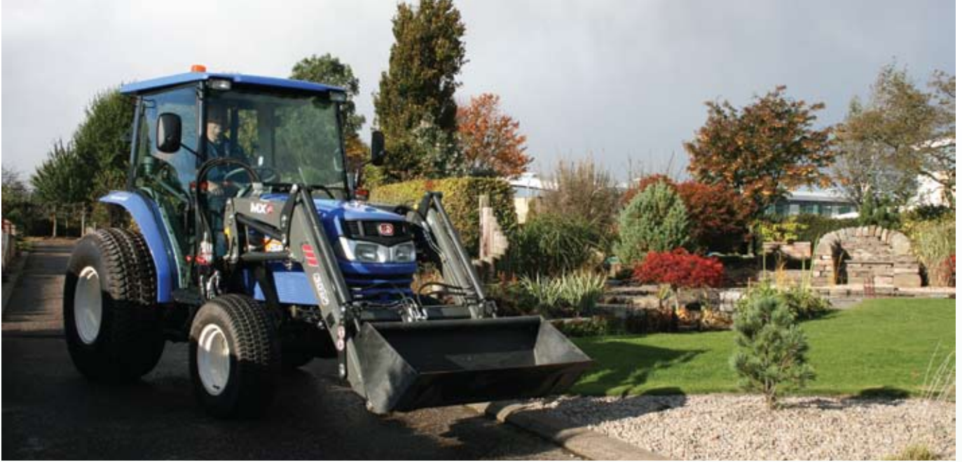
Dundee College of Education

Fairways has enjoyed healthy sales figures over the past 12 months and we would like to thank all our customers for their continued support and valued business. Here are a few highlights: