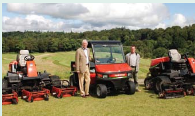
Ballindalloch Castle Golf Club