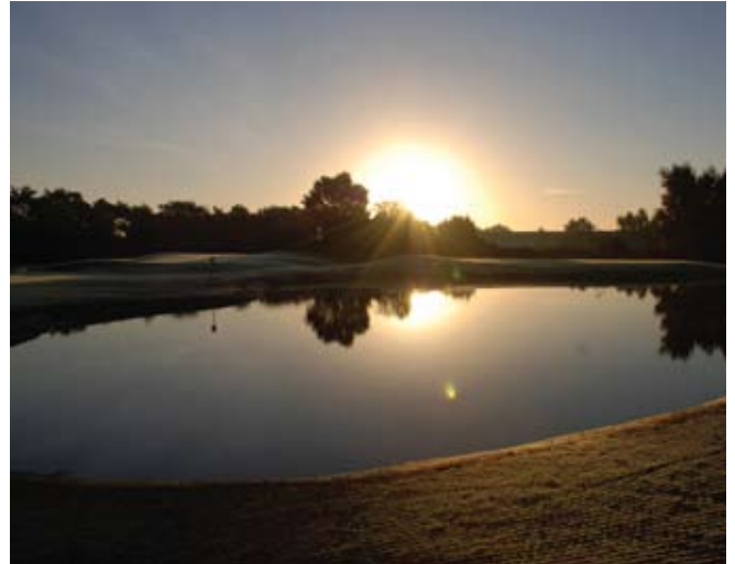
The new RJ National Course.

Environmental issues were carefully factored into the planning, design and construction of the RJ National course. Interesting areas of natural vegetation and individual trees were retained. Vegetation removal was minimised and heather was stripped, stored and later re-laid to frame the edges of the bunkers. The landscape and planting plan was also carefully designed to minimise environmental impact, with only native species being utilised.